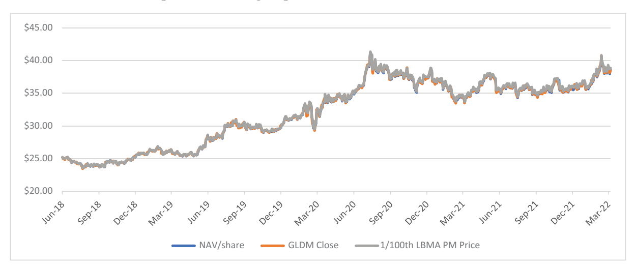
Share price & NAV v. gold price - June 26, 2018 to March 31, 2022

Investing in the Shares does not insulate the investor from risks, including price volatility. The following chart illustrates the movement in the market price of the Shares and NAV of the Shares against the corresponding gold price (per 1/100 of an oz. of gold) since the day the Shares first began trading on the NYSE Arca: