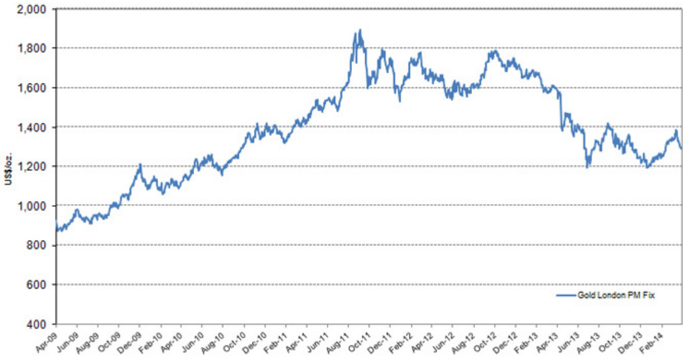
Daily gold price - April 1, 2009 to March 31, 2014

The following chart provides historical background on the price of gold. The chart illustrates movements in the price of gold in US dollars per ounce over the period from April 1, 2009 to March 31, 2014, and is based on the London PM Fix.