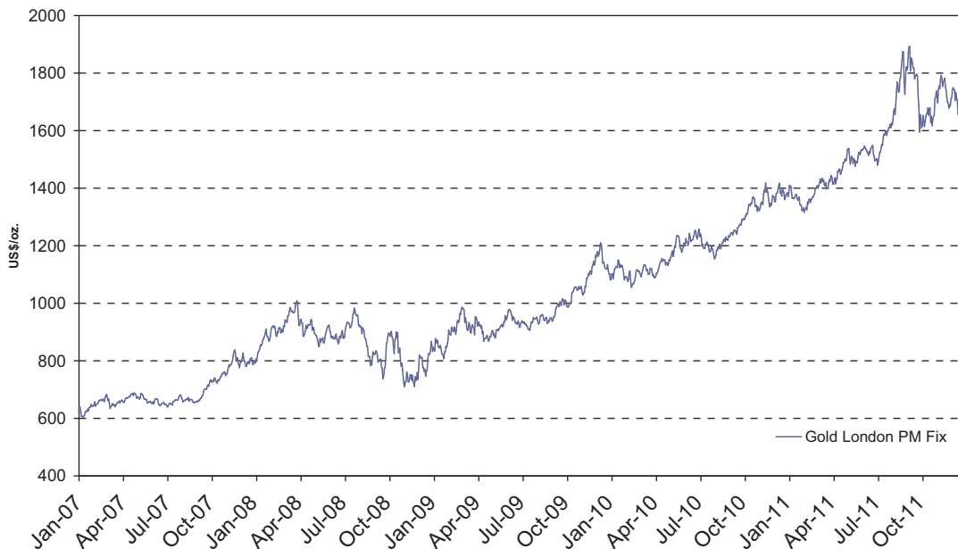
Daily gold price - January 1, 2007 to December 31, 2011

The average, high, low and end-of-period gold prices for the three and twelve month periods over the prior three years and for the period from the Date of Inception through December 30, 2011, based on the London PM Fix, were: