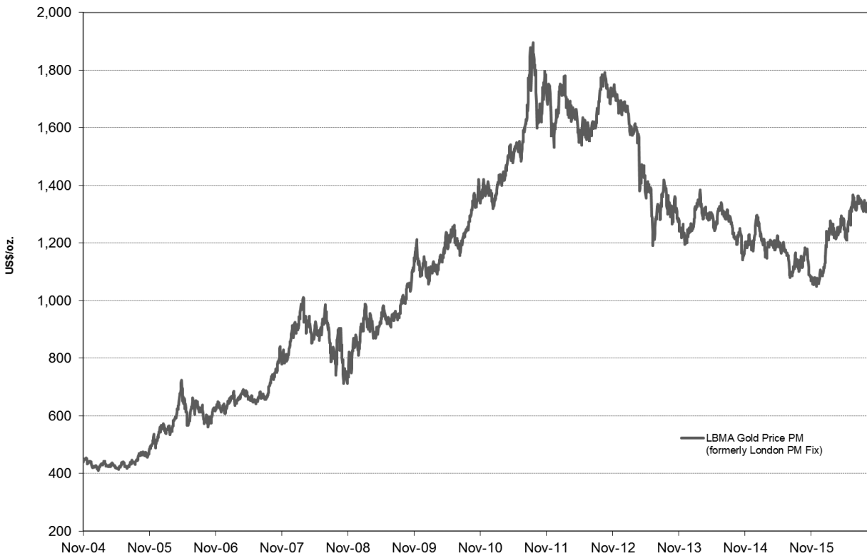
Daily gold price - November 18, 2004 to September 30, 2016

The following chart provides historical background on the price of gold. The chart illustrates movements in the price of gold in U.S. dollars per ounce over the period from the day the Shares began trading on the NYSE on November 18, 2004 to September 30, 2016, and is based on the London PM Fix until March 19, 2015 and thereafter is based on the LBMA Gold Price PM.