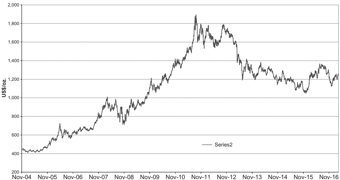
Daily gold price - November 18, 2004 to March 31, 2017

The following chart provides historical background on the price of gold. The chart illustrates movements in the price of gold in U.S. dollars per ounce over the period from the day the Shares began trading on the NYSE on November 18, 2004 to March 31, 2017, and is based on the LBMA Gold Price PM when available from March 20, 2015 and previously the London PM Fix.