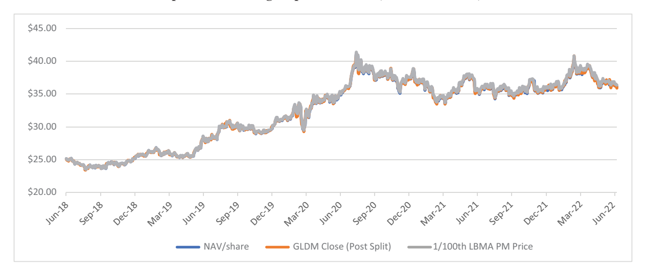
Share price & NAV v. gold price - June 26, 2018 to June 30, 2022

Investing in the Shares does not insulate the investor from risks, including price volatility. The following chart illustrates the movement in the market price of the Shares and NAV of the Shares against the corresponding gold price (per 1/100 of an oz. of gold) since the day the Shares first began trading on the NYSE Arca: