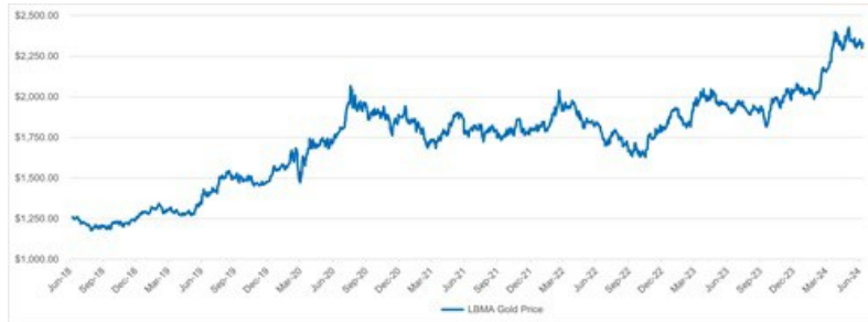
Daily Gold Price - June 26, 2018 to June 30, 2024 LBMA Gold Price PM USD

The average, high, low and end-of-period gold prices for the three and twelve-month periods over the prior three years and for the period from June 26, 2018 (the first date the Shares began trading on the NYSE Arca) through June 30, 2024, based on the LBMA Gold Price PM, were: