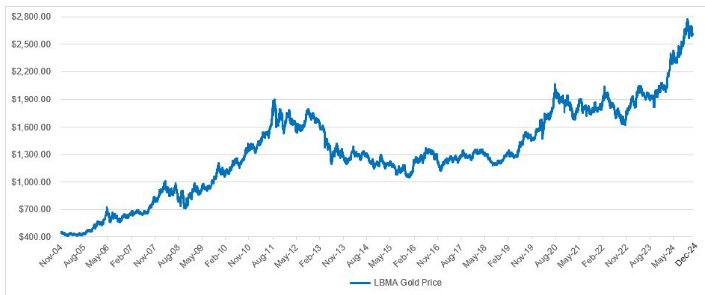
Daily Gold Price – November 12, 2004 – December 31, 2024 LBMA Gold Price PM USD

The average, high, low and end-of-period gold prices for the three and twelve-month periods over the prior three years and for the period from the Date of Inception through December 31, 2024, based on the LBMA Gold Price PM when available from March 20, 2015 and previously the London Fix, were: