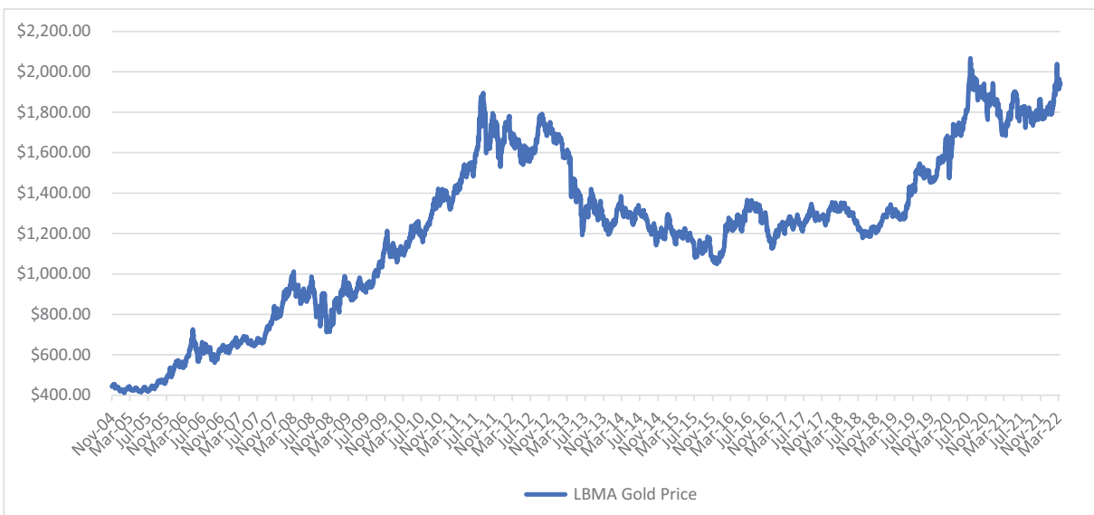
Daily Gold Price – November 4, 2004 – March 31, 2022 LBMA Gold Price PM USD

The following chart provides historical background on the price of gold. The chart illustrates movements in the price of gold in US dollars per ounce over the period from November 4, 2004 to March 31, 2022 and is based on the LBMA Gold Price PM when available.