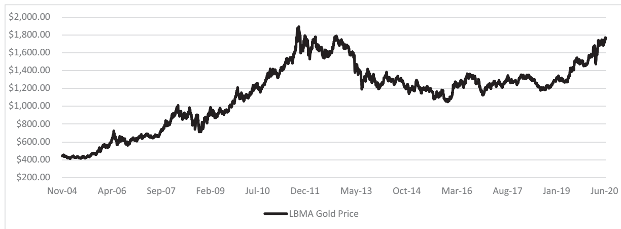
LBMA Gold Price—November 18, 2004 to June 30, 2020

As movements in the price of gold are expected to directly affect the price of the Shares, investors should understand what the recent movements in the price of gold have been. Investors, however, should also be aware that past movements in the gold price are not indicators of future movements. The following chart provides historical background on the price of gold. The chart illustrates movements in the price of gold in U.S. dollars per ounce over the period from the day the Shares began trading on the NYSE on November 18, 2004 to June 30, 2020 and is based on the LBMA Gold Price PM when available from March 20, 2015 and previously the London PM Fix.